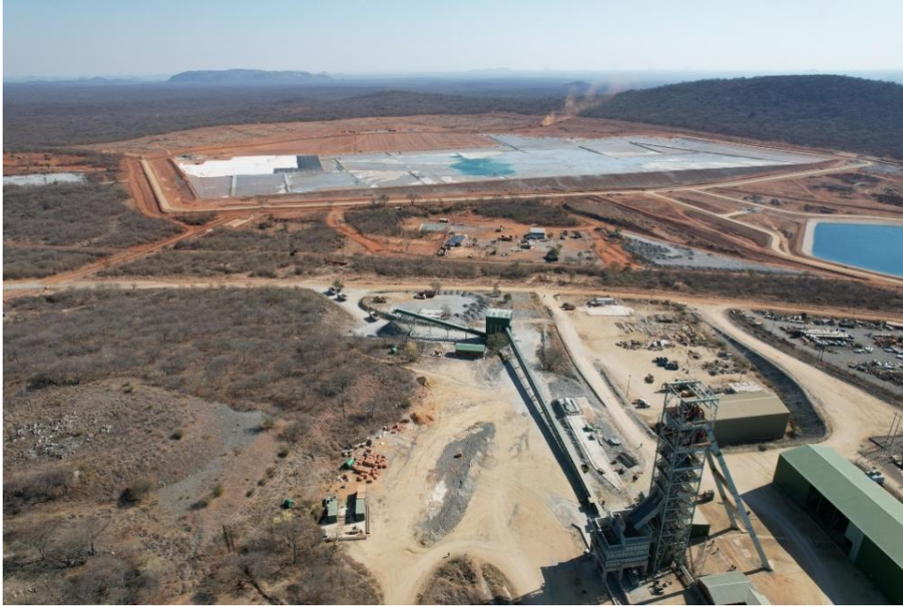
Aerial View – Blanket Mine