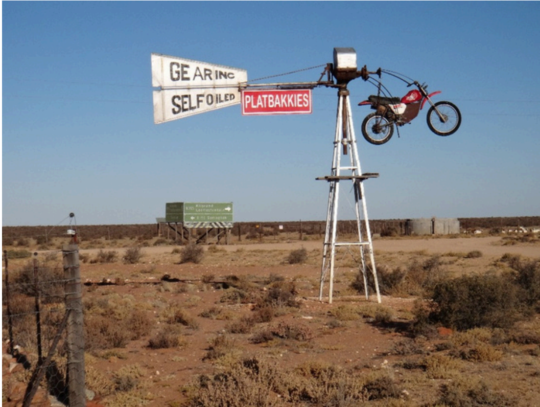
First Place: Platbakkies (Mike de Wit)

The conference also boasted a photo competition with entries to reflect the spirit of Namaqualand. The three winners, whose photos will all be used in upcoming Geobulletins are: