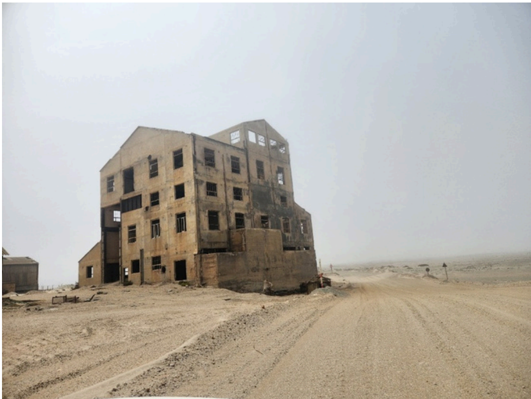
Second Place: The old HMS and sort house at Alexander Bay (Kabelo Mongalo)